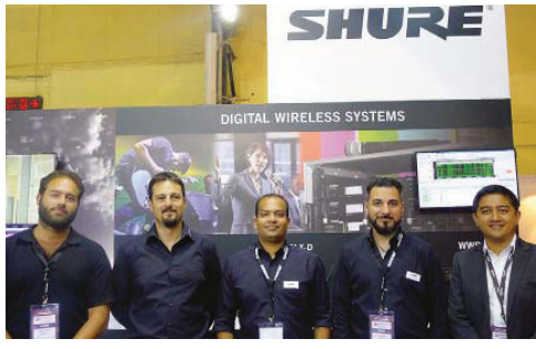
A large team from Shure had come to assist distributor Sun Infonet with demos and the South Asian launch of Axient