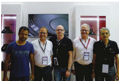
The Stonewater and Precision Devices teams on the PD booth