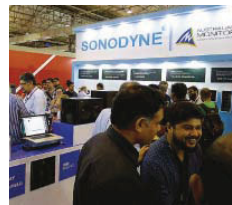
Sonodyne stand party