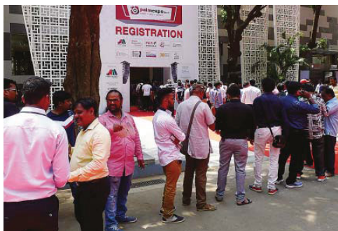
Registration queues went round the block on the first day

Now in its 17th year, Palm Expo India holds a mirror to the region's rapidly expanding entertainment industry. PAA looks at how the show is faring