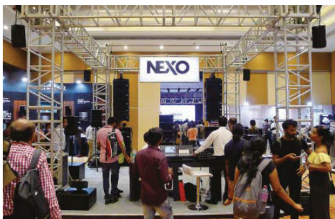
The Yamaha and Nexo demo halls